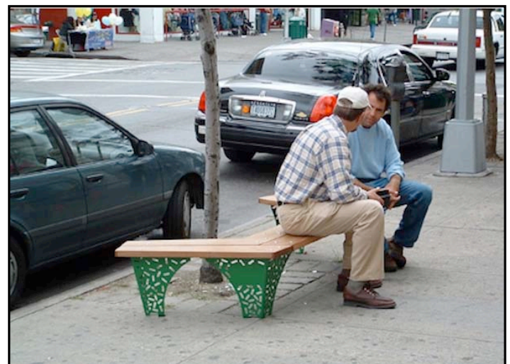
Examples of seats that do get used